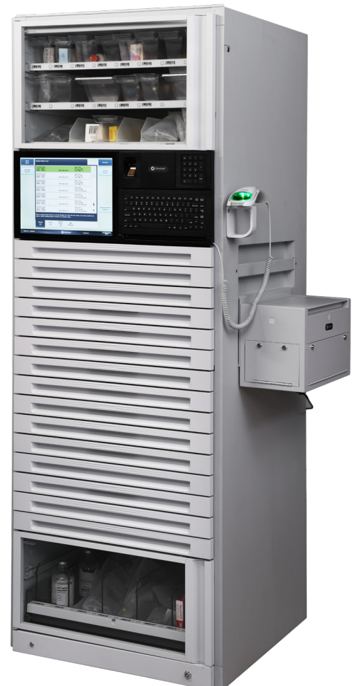
Omnicell® XT Automated Dispensing Cabinet

Superior data visibility to drive accountability and compliance.