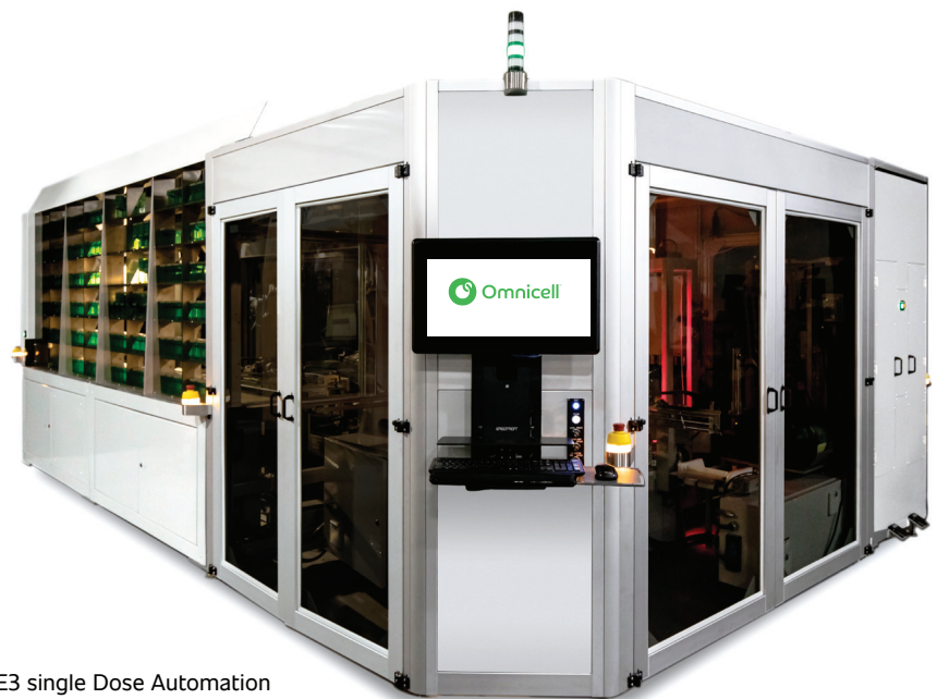
E3 single Dose Automation